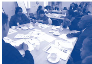
Working group taking the project forward